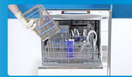
Cleaning & disinfection with MELA therm